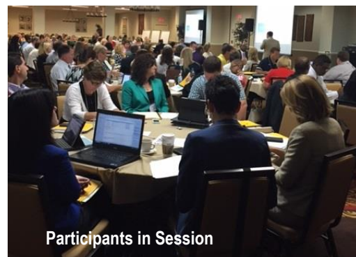
Participants in Session